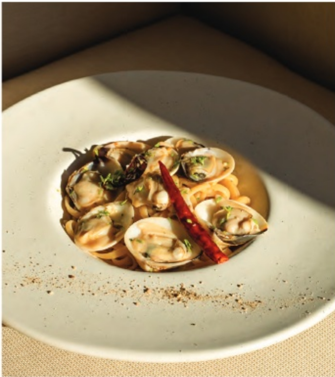
Linguine Vongole Sweet Clams and White Wine