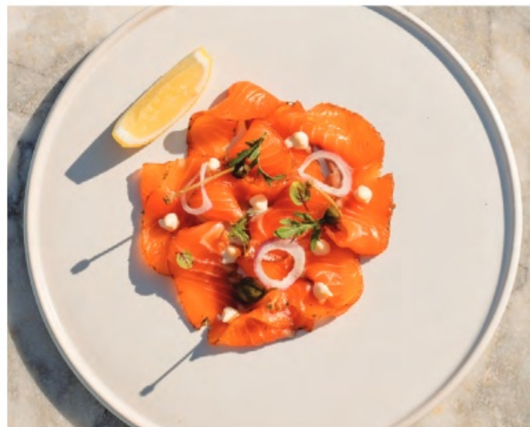
Salmon Gravalax with Hoseradish Cream and Dill 340.-