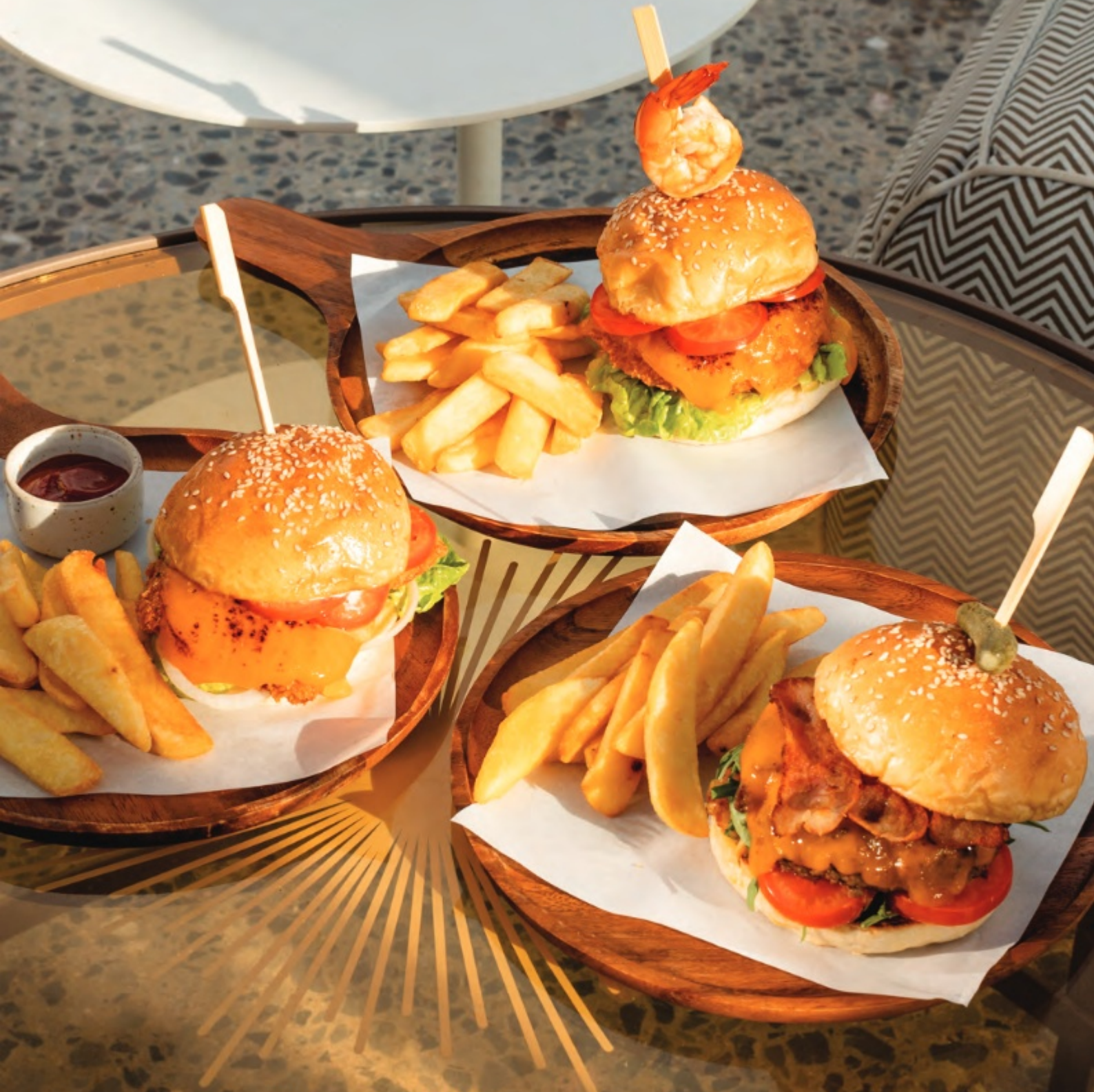
Fish Burger with Pickle and Dill Dressing