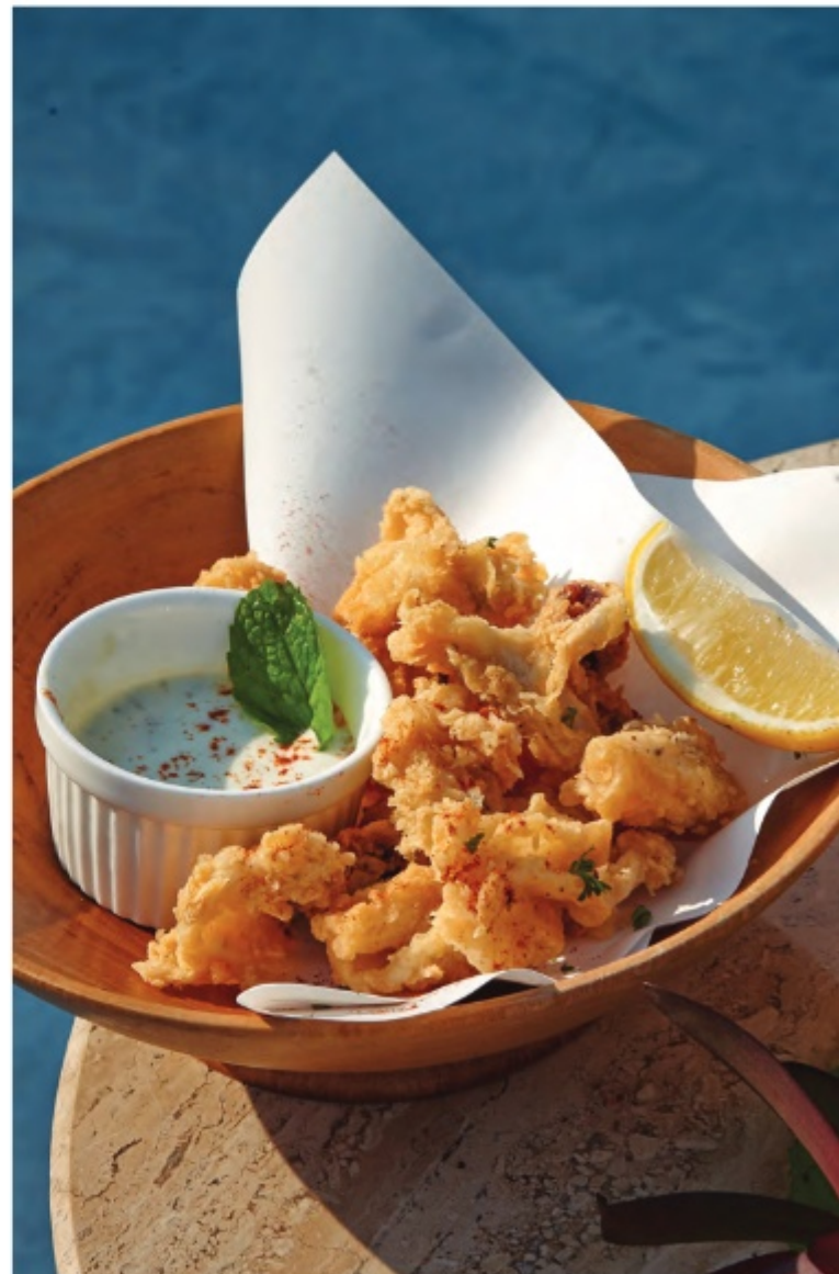
Crispy Calamari with Lemon / Lime Sauce 320.-