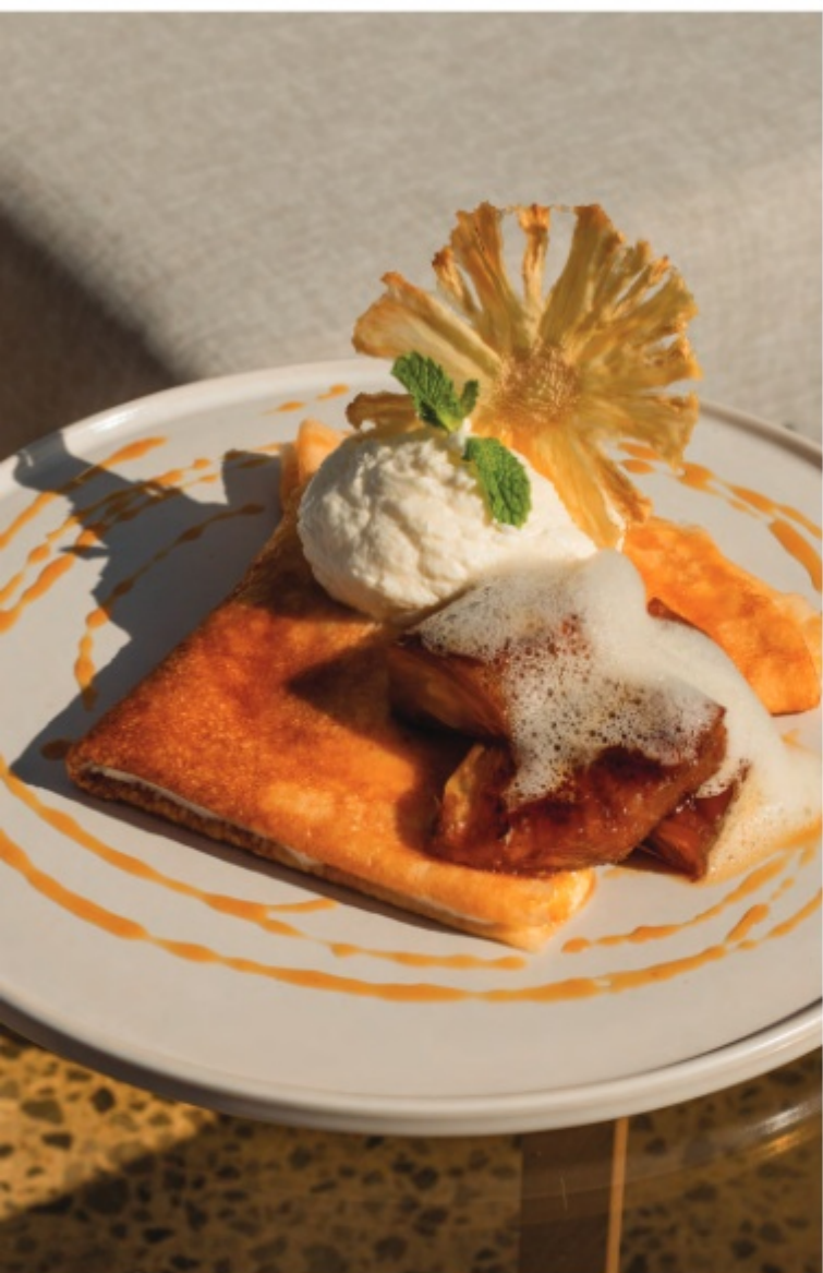
Piña Colada Crêpes Suzette Mixed Berries Chocolate Sababon Ice-Cream Scoop