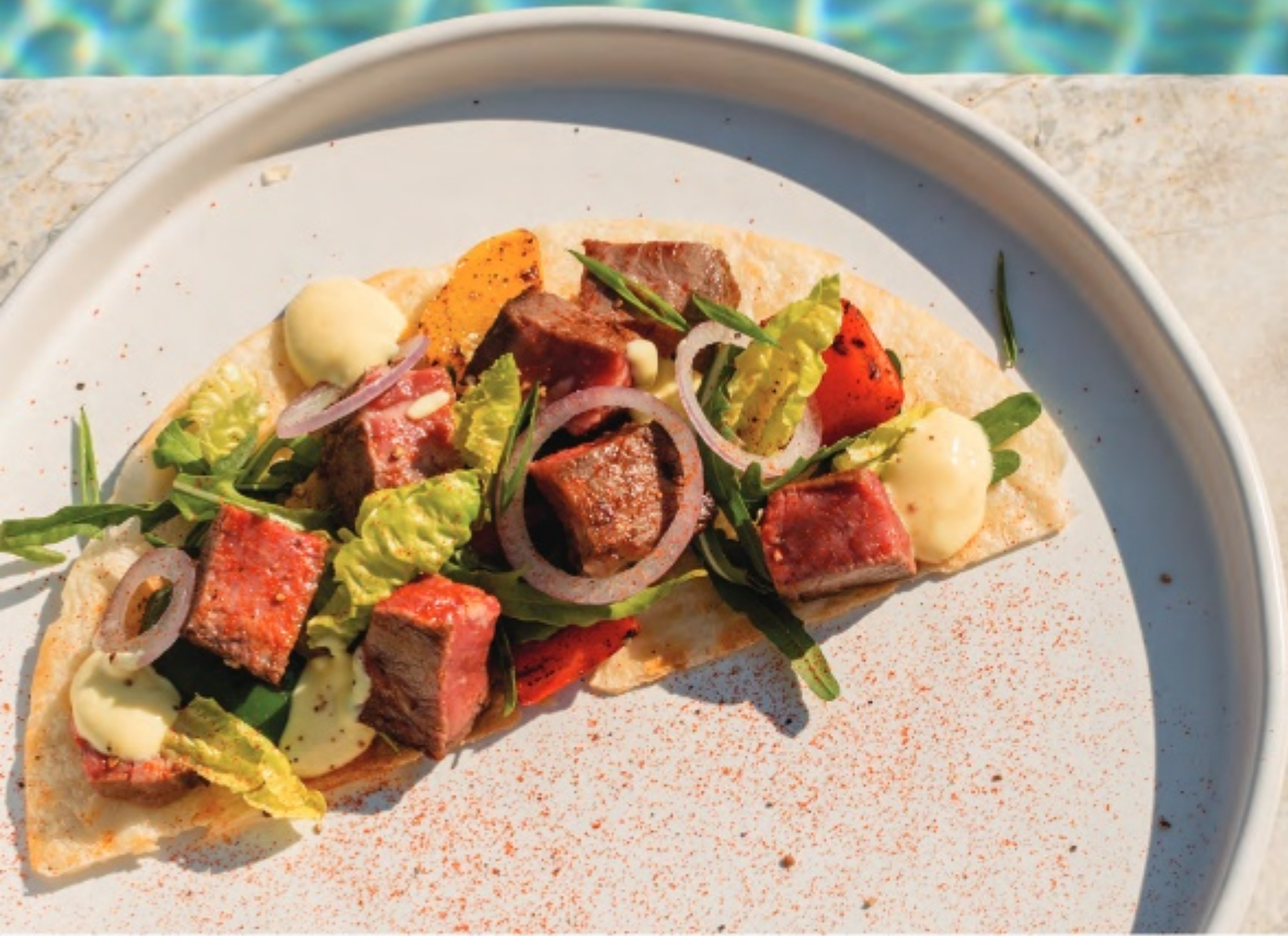
Beef Tendori, Grilled Bell Pepper, Crispy Tortilla and Mustard Yougurt Salad