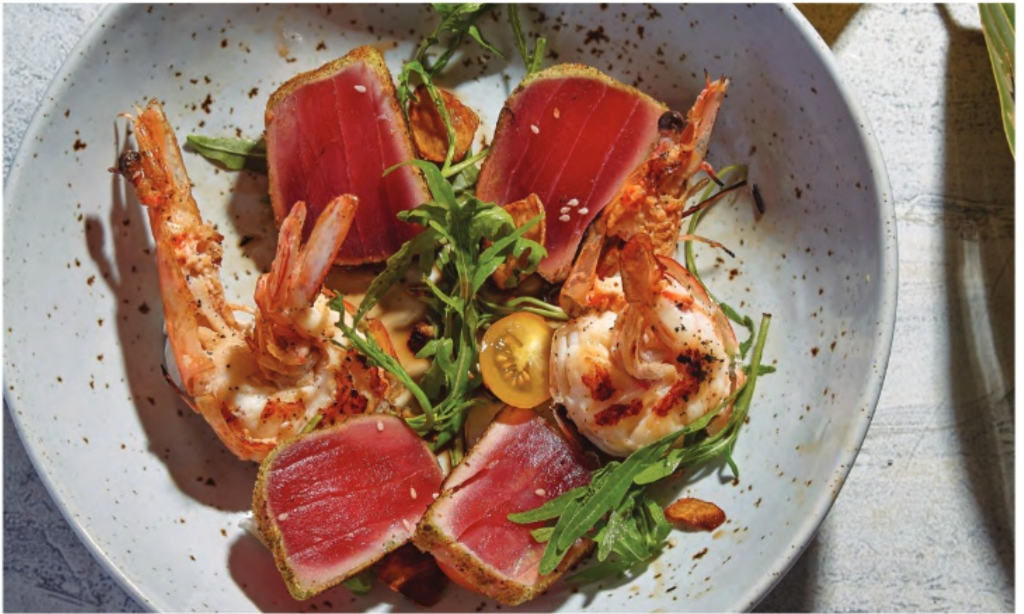
Tuna Tataki & Garlicky Grilled Shrimp with Sumac