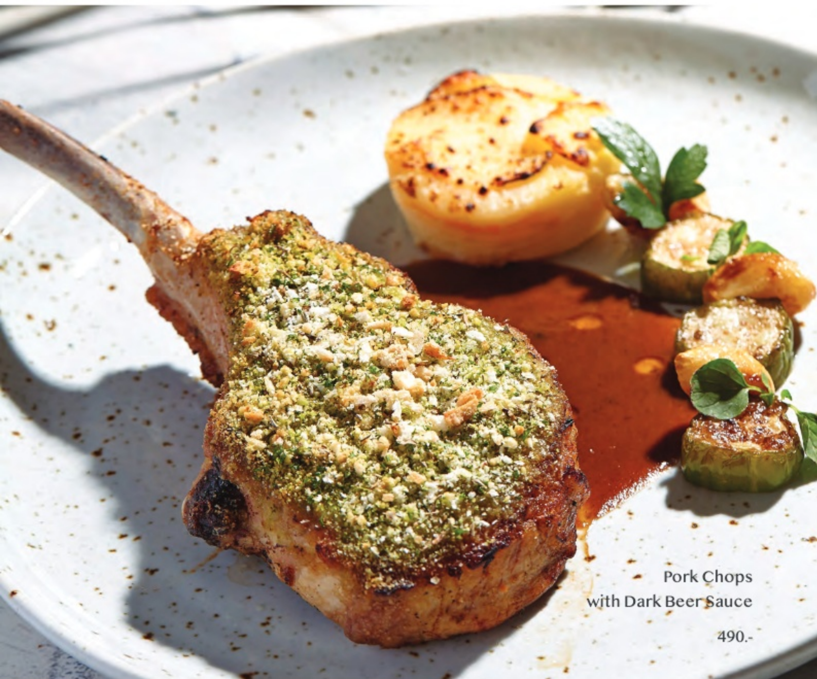
Pork Chops with Dark Beer Sauce 490.-