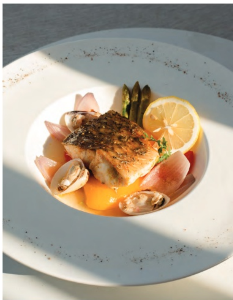
Steam Seabass, Seasonal Vegetable, Tomato concasse and Aioli Sauce 390.-