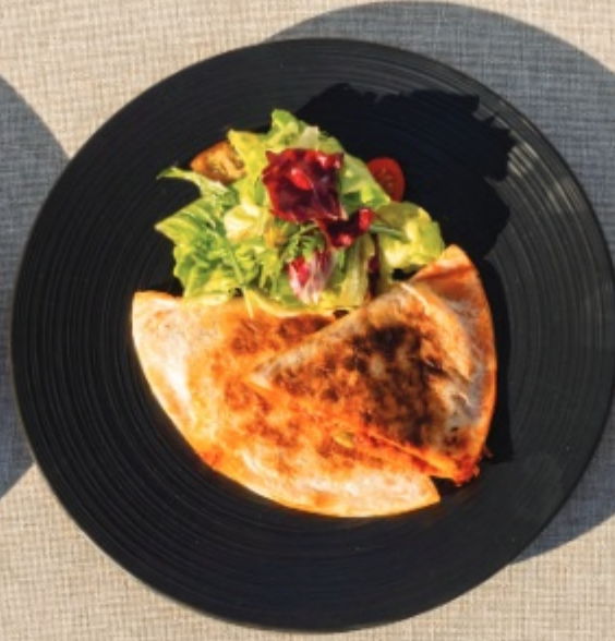
Beef Quessadilla (Bolognese)