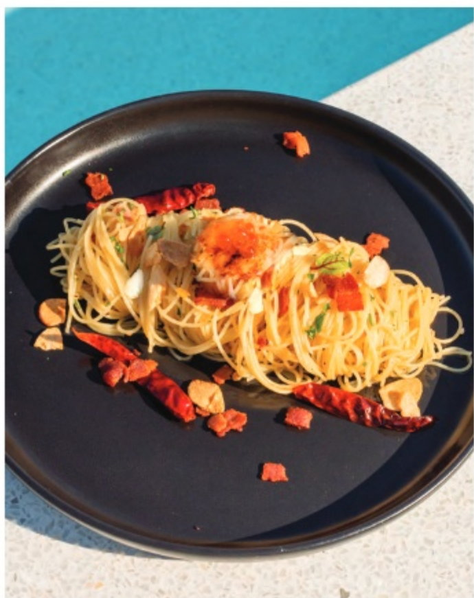
Capellini Aglio E Olio with Crab Meat and Crispy Bacon 390.-