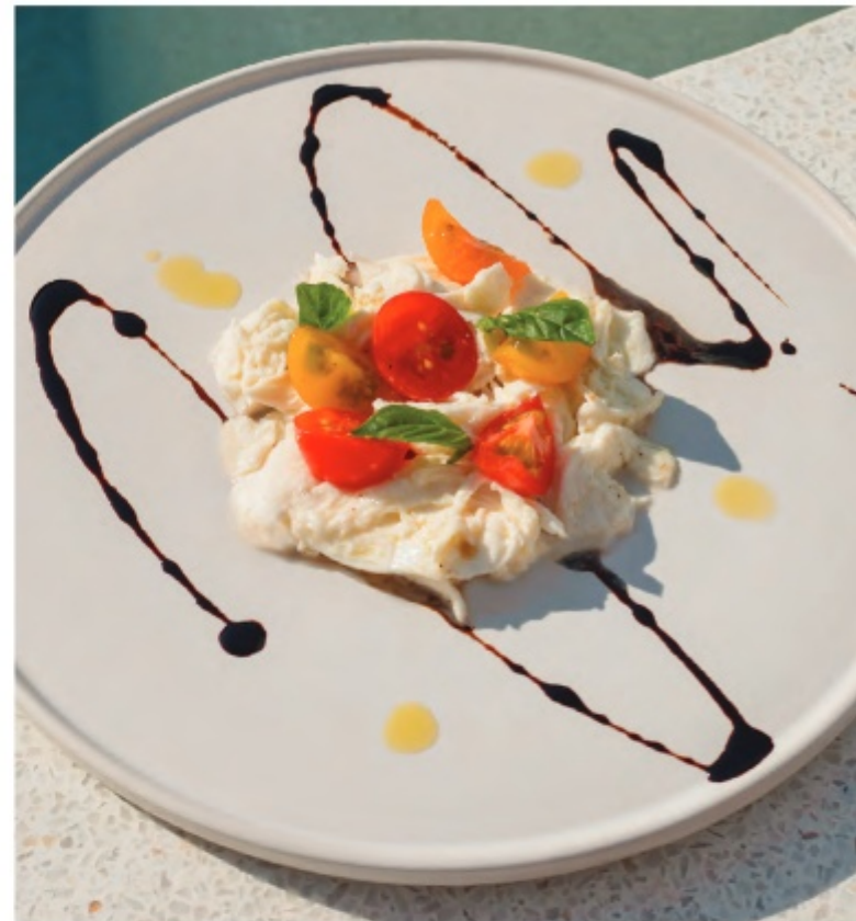
Sundance Caprese Tomatoes with Buffalo Mozzarella Cheese