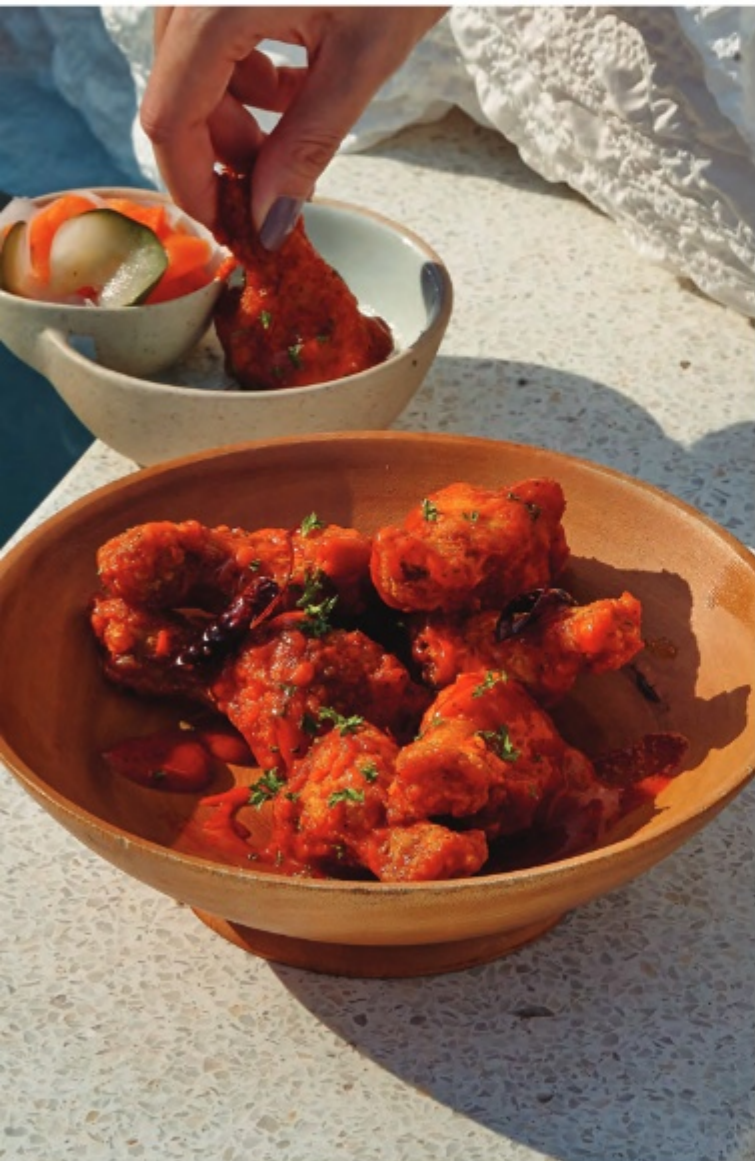
Buffalo Chicken Wings with Blue Cheese Sauce 320.-