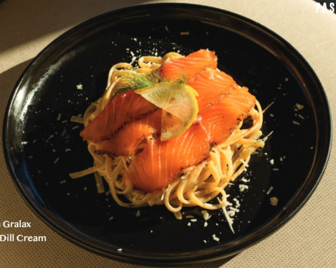
Linguine Salmon Gralax with White wine Dill Cream