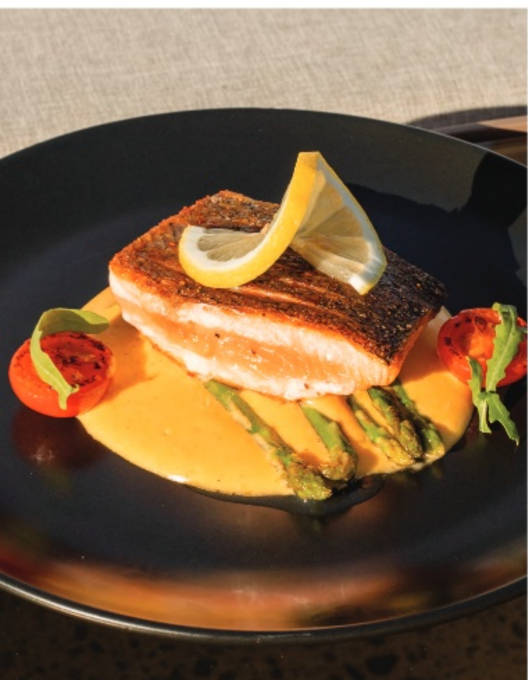
Grilled Tasmanian Salmon, Asparagus, Pan Seared Half Tomato and Mousseline Sauce 450.-