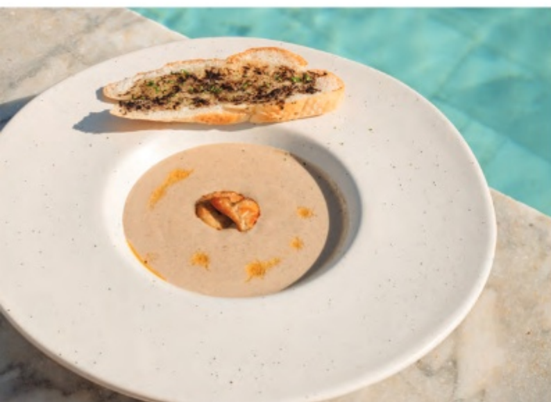
Lobster Bisque with Grilled Tiger Prawns and Crispy Parma Ham