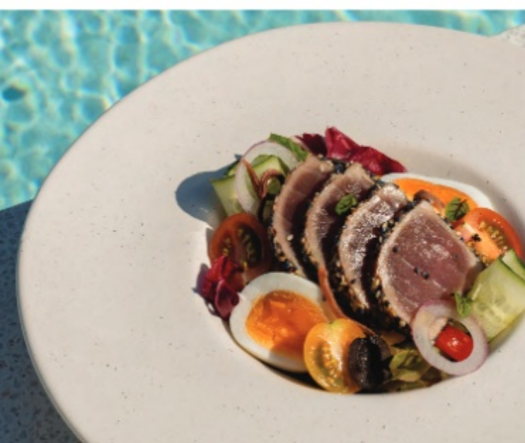
Remixed Niçoise Salad