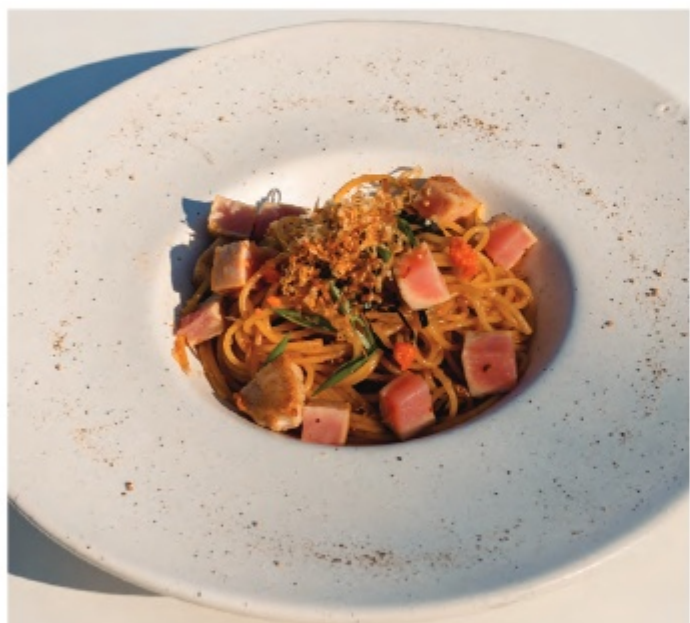
Mentaiko Spaghetti with Seared Tuna 390.-