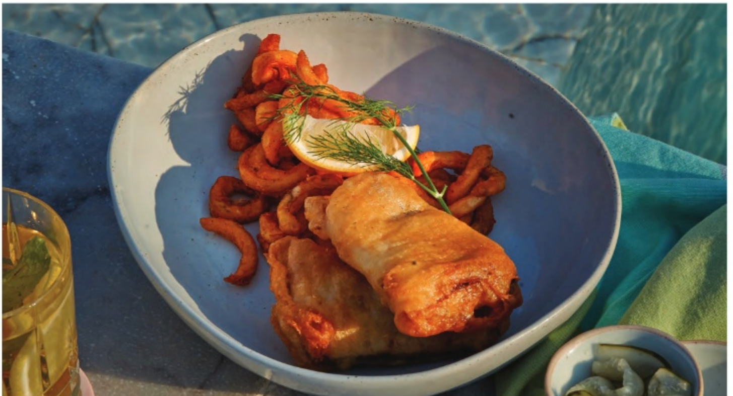
Fish & Chips with Tartar Dip 380.- Shrimp & Chips with Wasabi Mayo 420.-

PRICES ARE SUBJECTED TO 10% SERVICE CHARGE AND 7% VAT