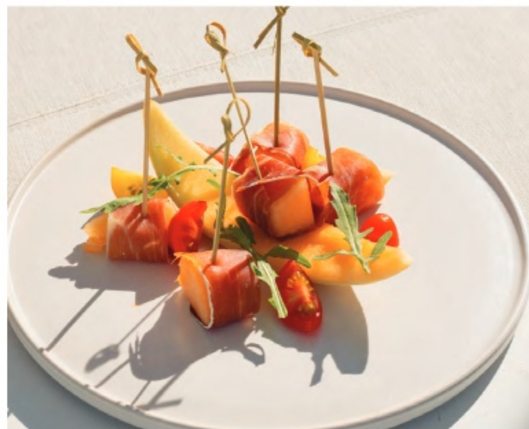
Prosciutto Cantaloupe 280.-