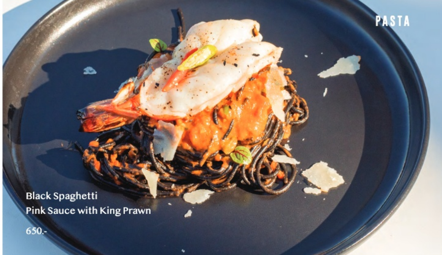
Black Spaghetti Pink Sauce with King Prawn 650.-