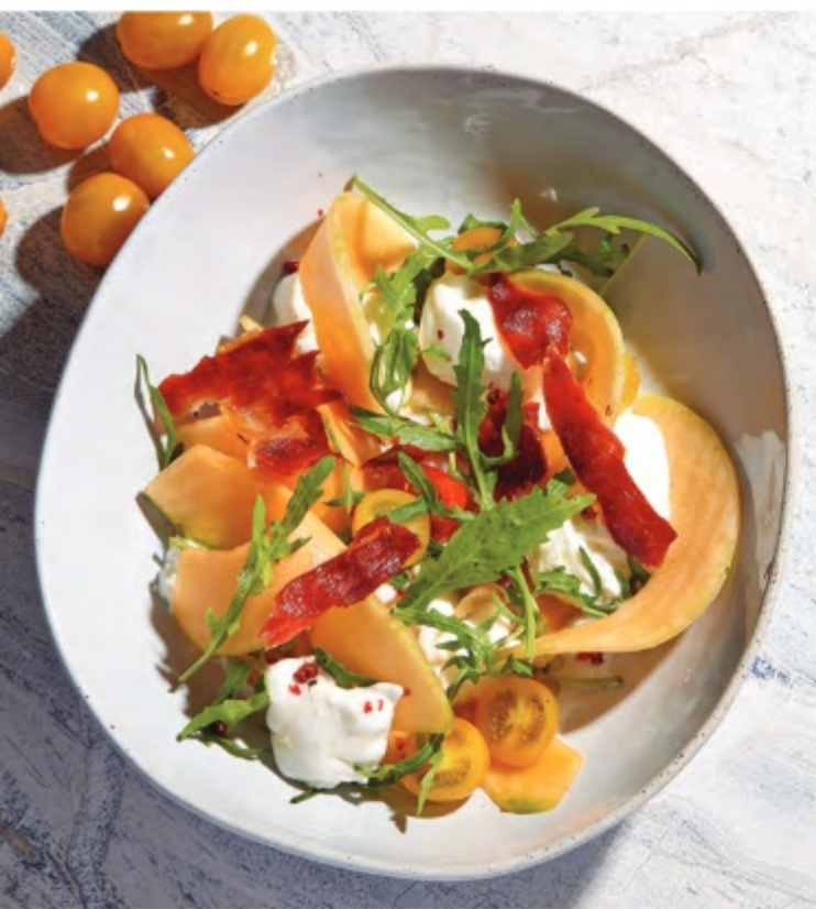
Fresh Melon, Mozzarella & Crispy Jamon Ham Salad