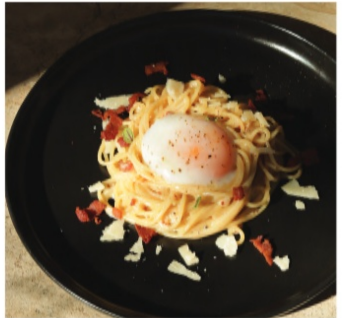
Spaghetti Carbonara with Crispy Bacon and Sous Vide Poached Egg