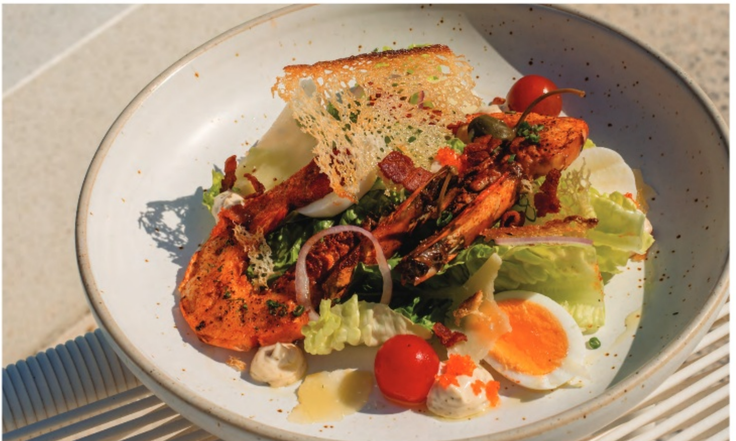
Giant Prawns with Ceasar Salad