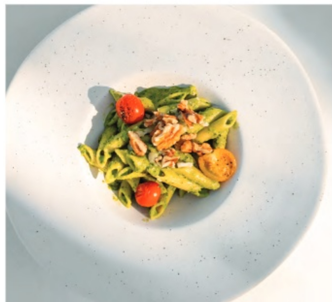
Penne Pesto (V) 280.-