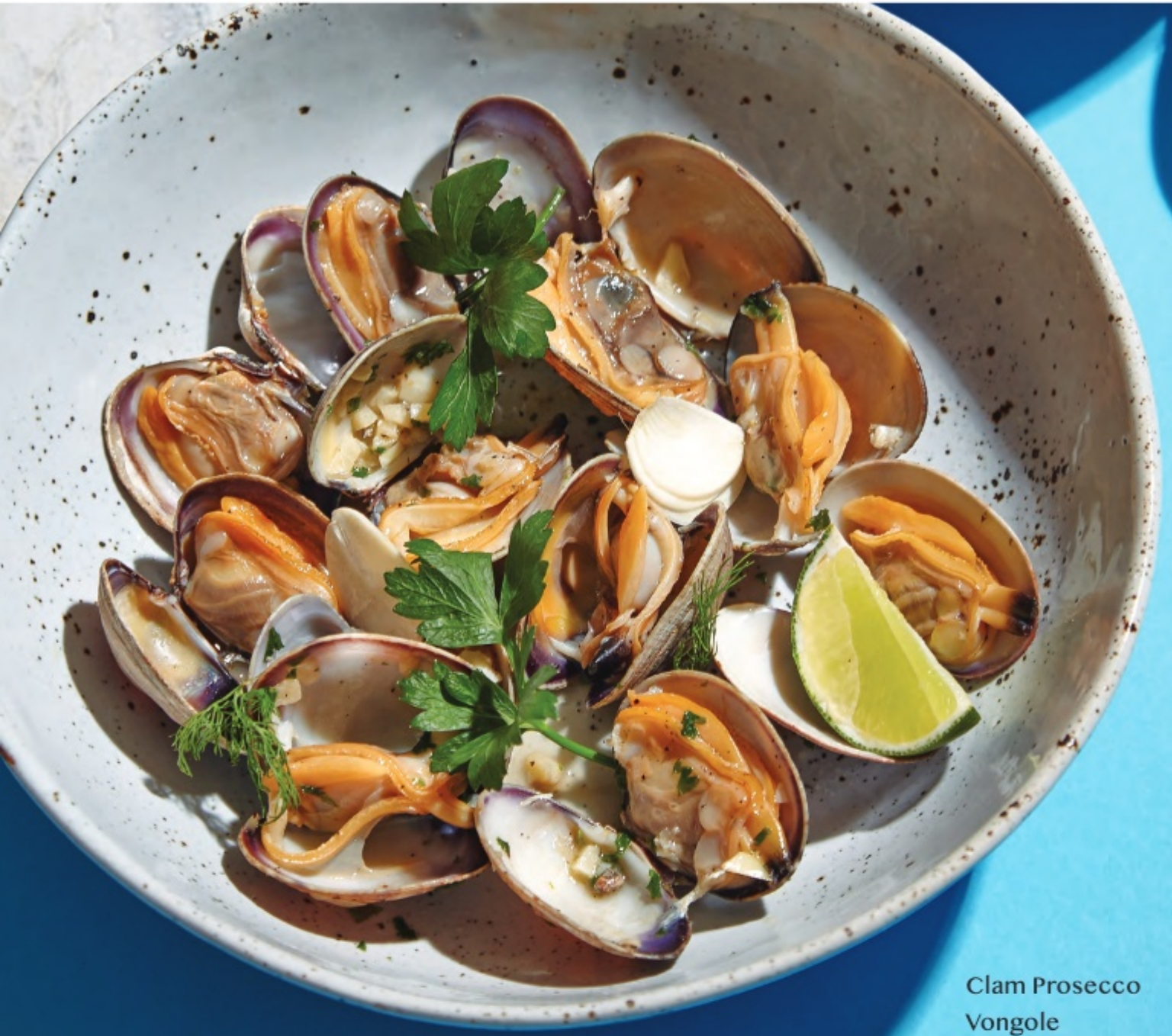
Clam Prosecco Vongole 320.-