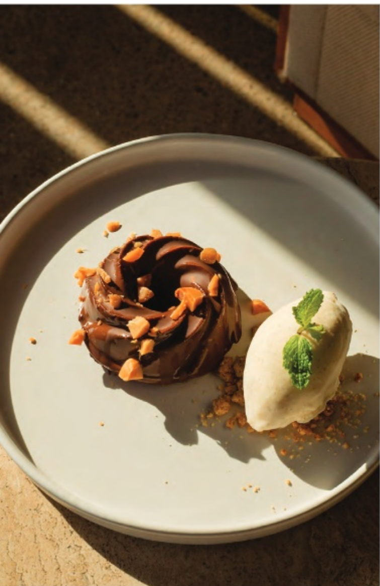
Chocolate Bundt Cake with Vanilla Ice-cream Mixed Berries Mille Feuilles