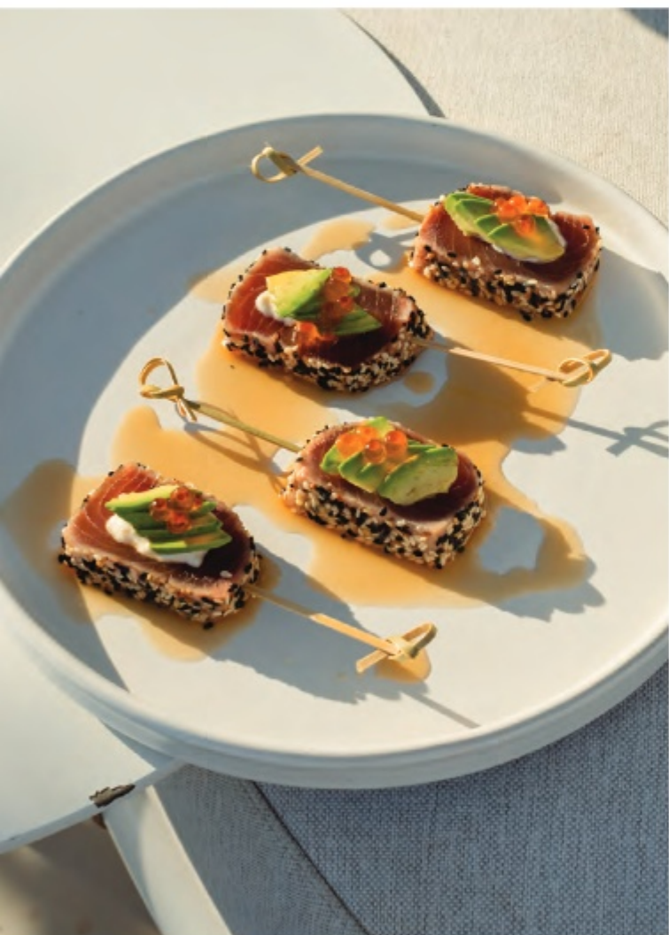
Tuna Cubes 320.-