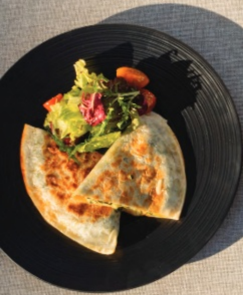
Spinach & Sweet Corn Cheese Quessadilla (V)